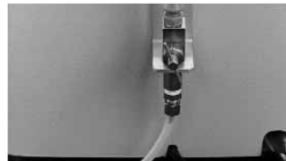
1b. Water fitting (Optional submersible pump or direct water line)

1. Your machine comes completely assembled and includes: a flexible water spout, electrical cords and a drain hose. The flexible water spout is equipped for either a direct water line or a line feed from the optional submersible pump.