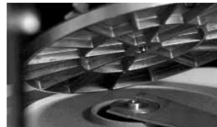
2c. Mounting 1/4 - 20 thread screwback discs/laps

Place the wheel on the motor mount, inserting the wrench between the wheel and the motor. Fasten the wheel securely with the mounting nut.