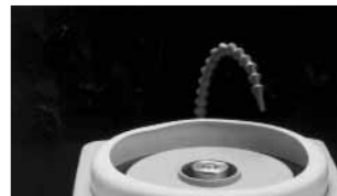
4. White rubber splash guard

3. When not in use, the wrench can be mounted on the side of the machine with the included ferrite magnetic strip.