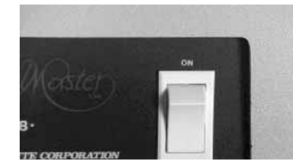
7. On/Off Switch