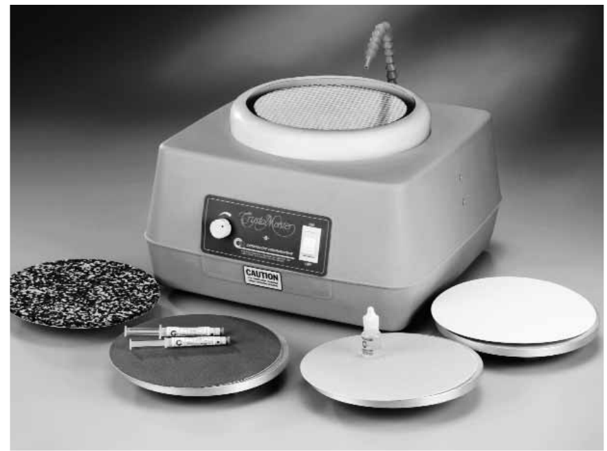
CrystalMaster™ 8 shown with optional Companion Kit