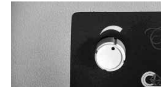
6. Variable Speed Controller

SPECIAL NOTE: Be sure to use Crystal Cut rust inhibitor in your coolant supply. This will aid in reducing swarf and help your machine and discs run rust free.