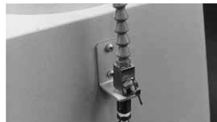
1c. Variable water control