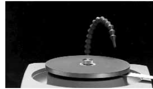
2a. Mounting 1/2" arbor discs/laps

2. Your machine will accept discs/laps with a 1/2" arbor or with a 1/4 - 20 thread screwback mount.