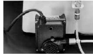
1d. Optional pump assembly

You can change the direction of the coolant flow by adjusting the flexible spout. However, for optimum results, we recommend that the coolant be directed to the center of the disc.