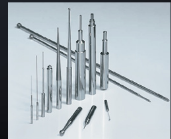
Typical products from a peel/pinch grinding operation.

Reengineered Roughing and Finishing wheel set can yield up to 4,000 parts per retrue. Ideal for grinding carbide, HSS, and 400 series surgical steel on Rollomatic and other leading CNC machines.