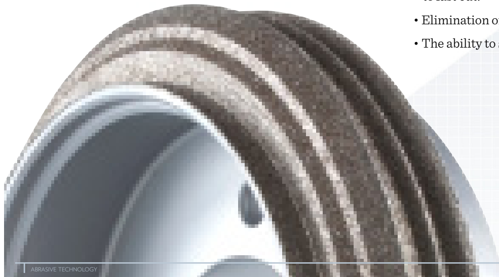
ELECTROPLATED FORM WHEEL