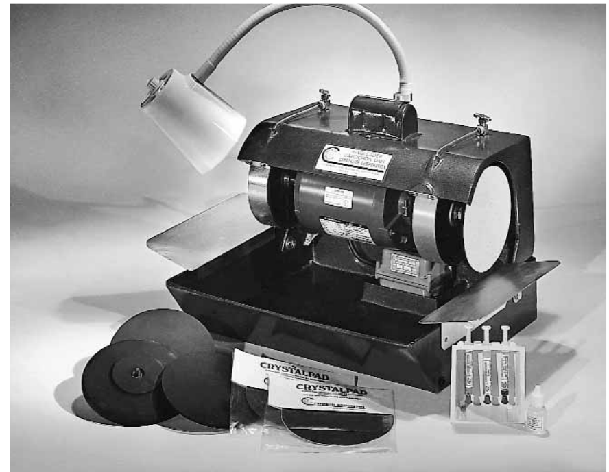
Ringleader™ shown with optional Companion Kit.