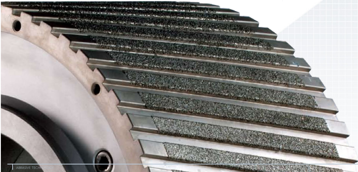
P.B.S. ® DRUM